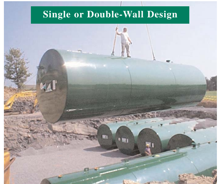
Single or Double-Wall Design