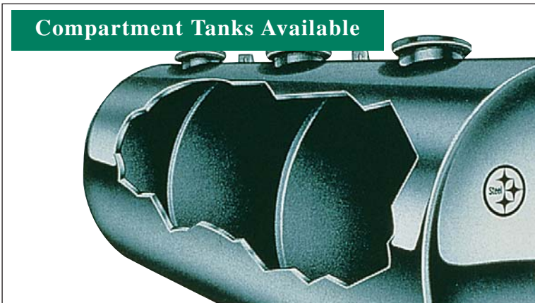
Compartment Tanks Available