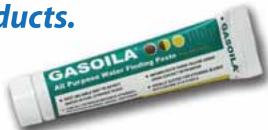
APO2 All Purpose Water Finding Paste