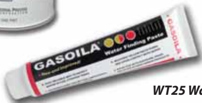
WT25 Water Finding Paste