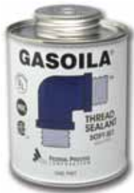
Soft-Set Thread Sealant