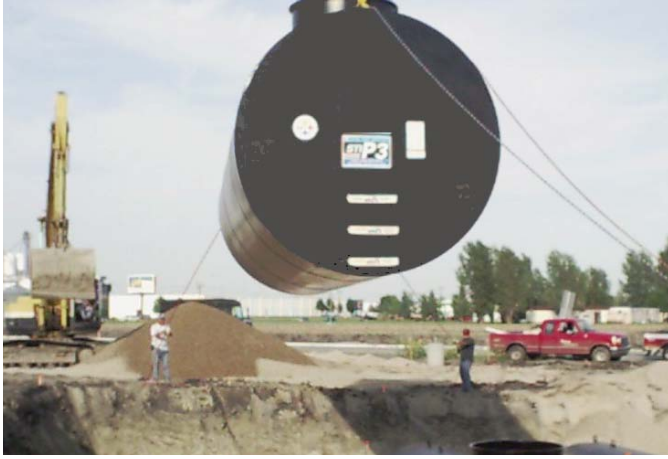
The only UST design which allows on-going monitoring of corrosion protection

sti-P 3 ® double-wall underground storage tank features a pre-engineered corrosion protection system that provides ongoing monitoring of corrosion protection. The sti-P 3 ® system has provided reliable, long-term performance for over a quarter million steel underground storage tanks.